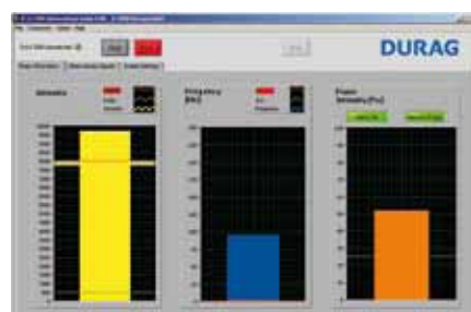
User interface of the flame monitor software