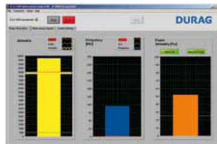
User interface of the flame monitor software